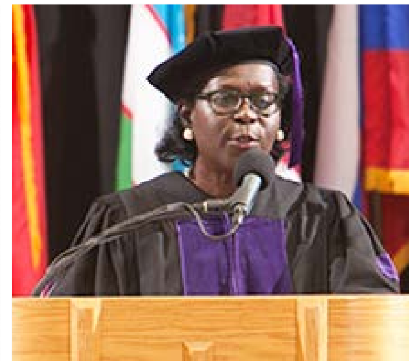
JUSTICE PATRICIA TIMMONS-GOODSON'S REMARKS AT DUKE LAW 2014 GRADUATION