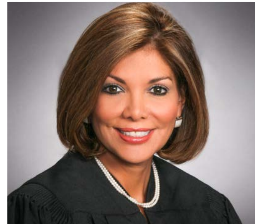
JUSTICE EVA GUZMAN ON DISSENTING JUDGES IN THE JUDICIAL PROCESS