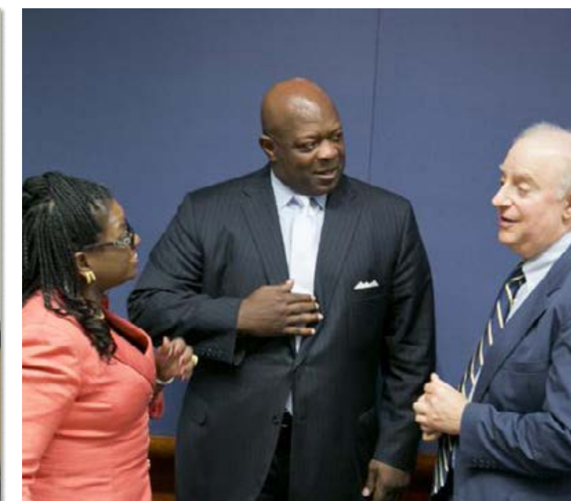
9.2.13 THE SHIFTING LANDSCAPE: CIVIL RIGHTS AND THE LAW OVER THE LAST 50 YEARS