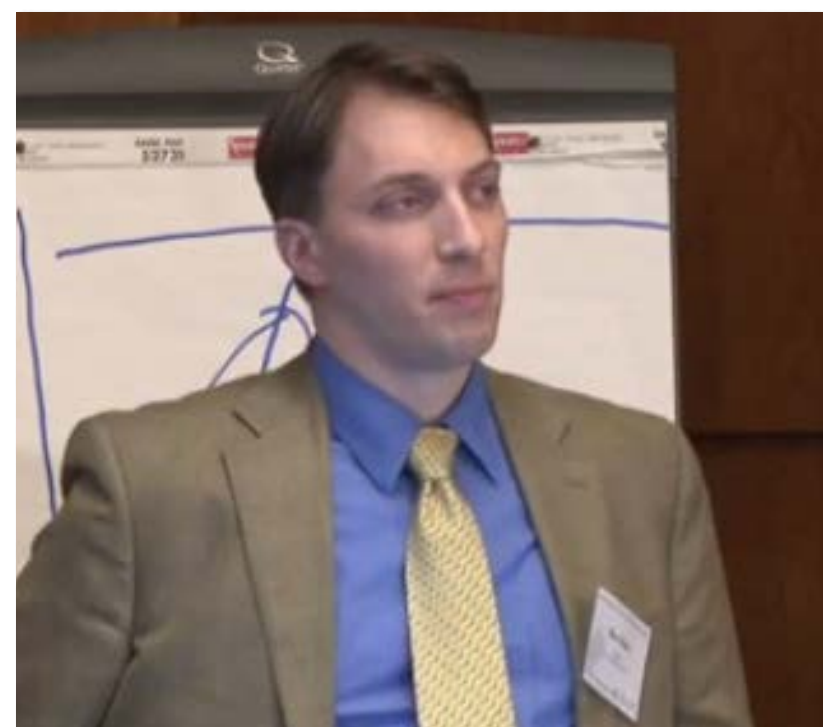
11.22.13 NEW APPROACHES AND INCENTIVES IN DRUG DEVELOPMENT CONFERENCE