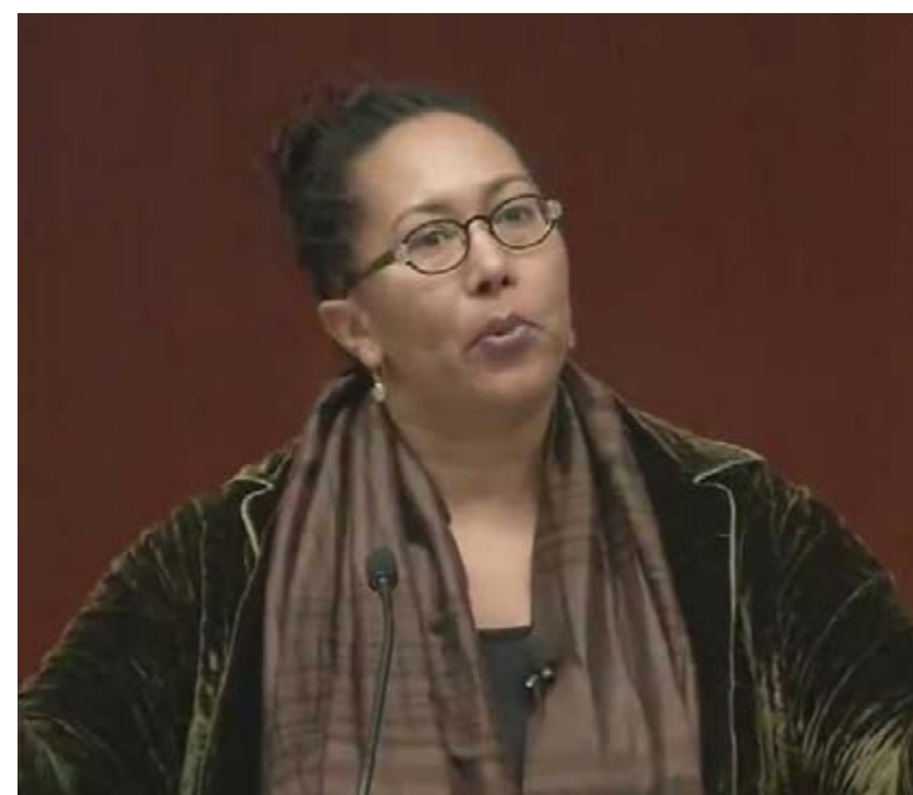
11.7.13 SLAVERY: BEYOND THE PURE PROPERTY PARADIGM