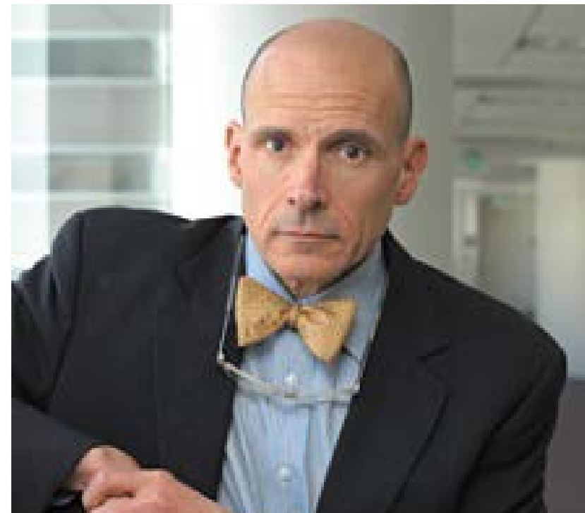
"THE BEST JUDGE YOU NEVER HEARD OF" BY JUDGE PAUL W. GRIMM