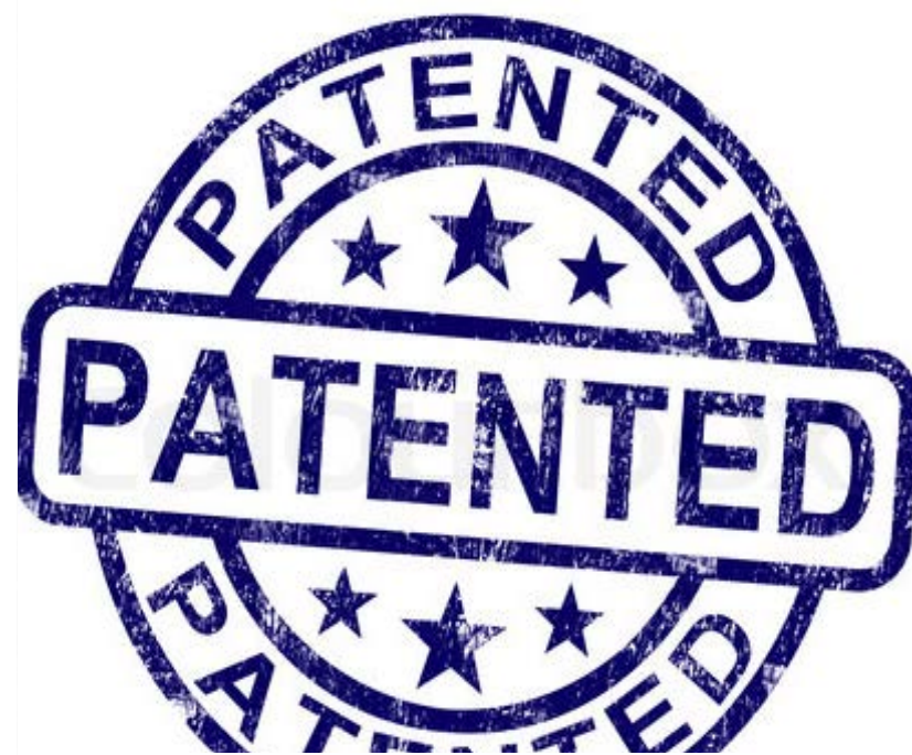
THE DUKE CONFERENCE: PATENT LAW INSTITUTE