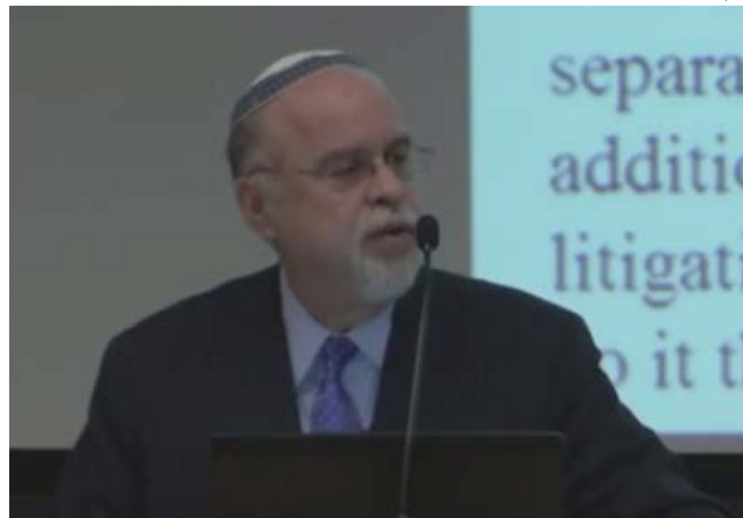
3.27.14 ANNUAL FREY LECTURE IN INTELLECTUAL PROPERTY: INFRINGEMENT 2.0