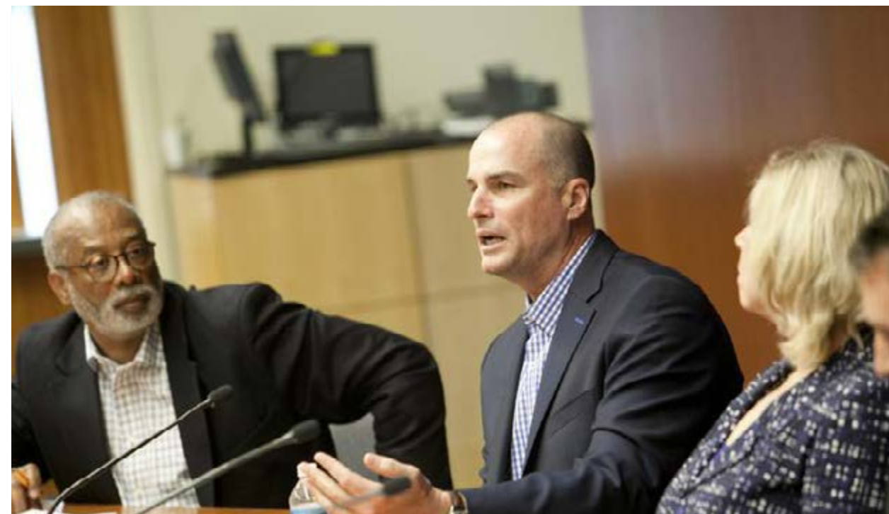
4.12.14 AMATEURISM AND COLLEGE ATHLETICS