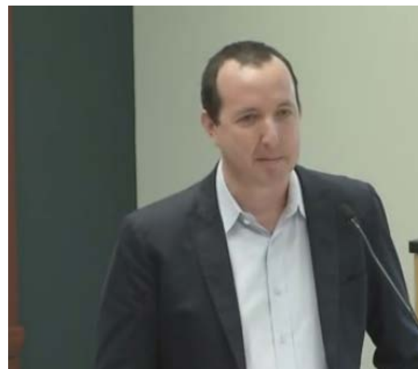
10.29.13 SOMETHING TO HIDE: NEW TECHNOLOGY, DRAGNET SURVEILLANCE, AND THE FUTURE OF PRIVACY