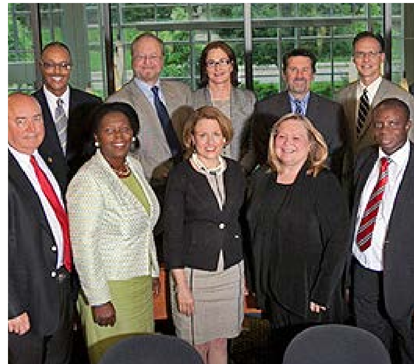
MASTER'S OF JUDICIAL STUDIES PROGRAM: THE JUDGES' ROUNDTABLE