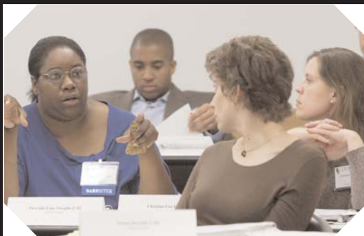
Future Forum Meeting