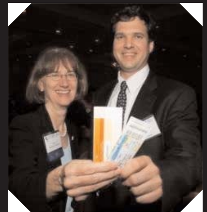
Raffling Rolling Stones tickets in support of the Annual Fund