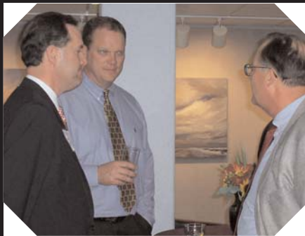
Thursday Night Welcome Reception