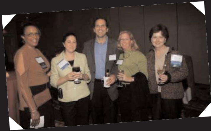
Friday Night Dinner & Reception