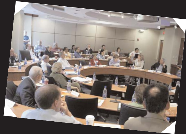
Board of Visitors Meeting